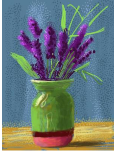
David Hockney's image